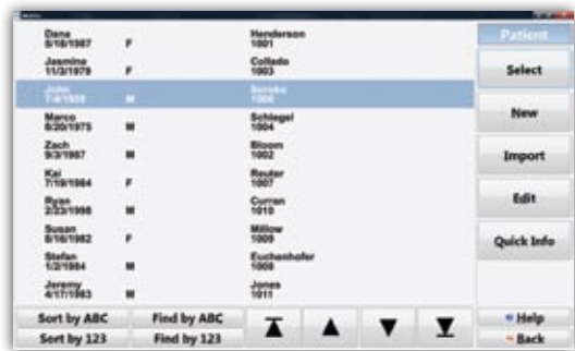
Manage your patients with the MedDoc Database

ATMOS MedDoc 2.6 can be used with any voice, speech and swallowing evaluation system, whether it is mobile or stationary. MedDoc can simplify your practice by keeping your work organized and saving you time. This software provides perfect image quality by recording uncompressed videos that are easily created, marked, edited, and exported. Additionally, MedDoc 2.6 provides a library of common ENT diagnoses` and findings that can be easily administered to a patient database. MedDoc software integrates easily with existing components, enabling you to quickly begin recording and exporting pictures and videos with MedDoc's advanced new features.